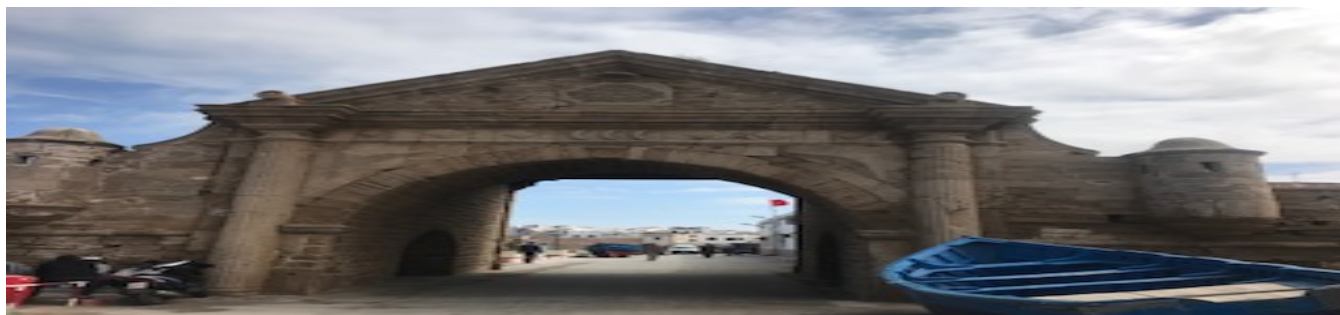
Port Gate into Essaouira which has symbols of